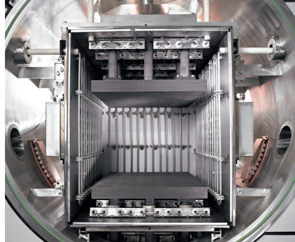
Diffusion Bonding Furnace