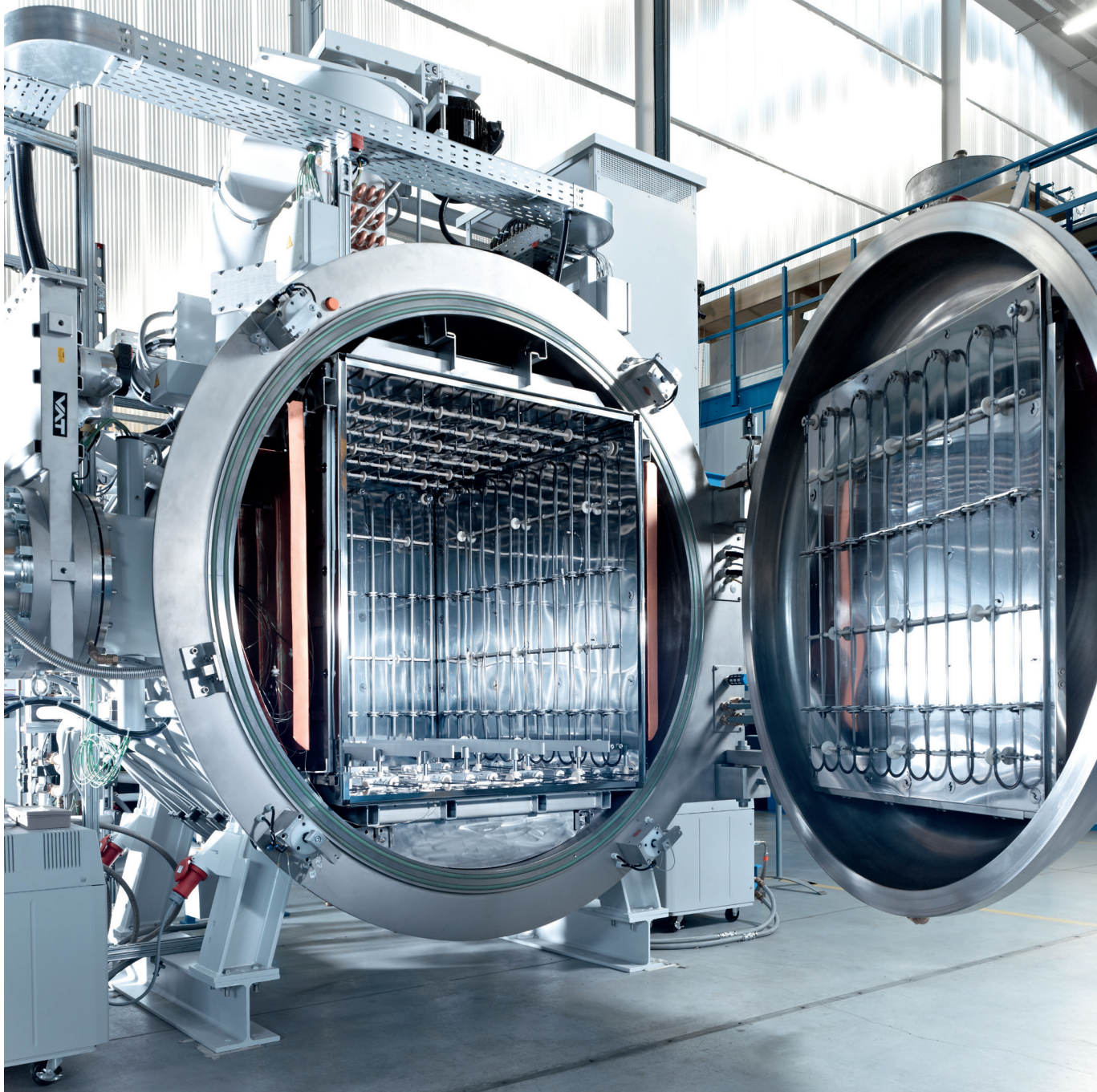
Resistance Heated High Vacuum Heat Treatment Furnace MOV