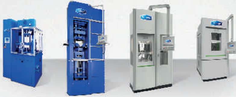
Mechanical powder presses of Series K