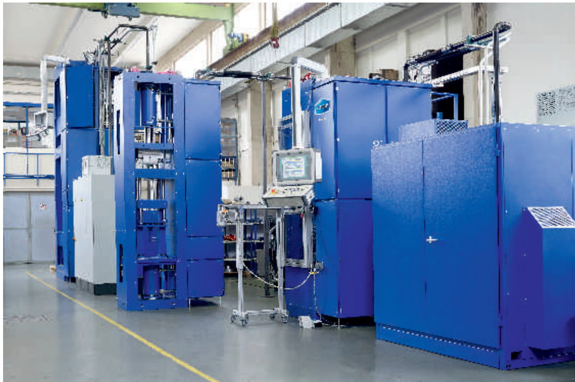
Presses from the S series under construction

The S series powder presses are KOMAGE's most powerful and flexible press systems. The high-performance hydraulic presses operate according to the ejection principle and are available with press forces of 50 kN up to 12,000 kN and a maximum of 9 controlled pressing axes.